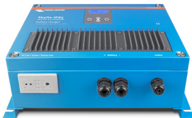
Skylla-IP65 12/60 (1+1)

To learn more about batteries and charging batteries, please refer to our book 'Energy Unlimited' (available free of charge from Victron Energy and downloadable from www.victronenergy.com ).