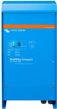
MultiPlus Compact 12/2000/80