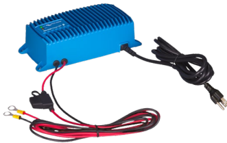
Blue Smart IP67 Charger 12/25