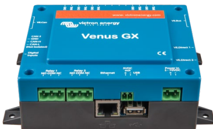
Venus GX front angle