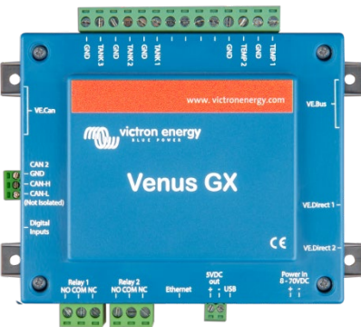
Venus GX with connectors