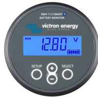
BMV-712 Smart Battery Monitor