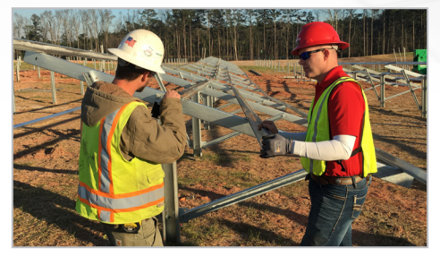
COMMERCIAL PARTNERSHIP EXPERIENCE THAT MAKES A DIFFERENCE