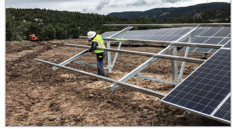
REFINED WITH YOU IN MIND