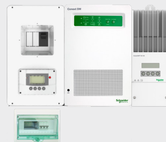
Configuration with SW PDP for 230 VAC