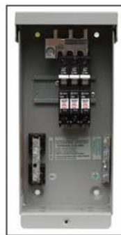
MNPV3 configured with three 150 VDC breakers