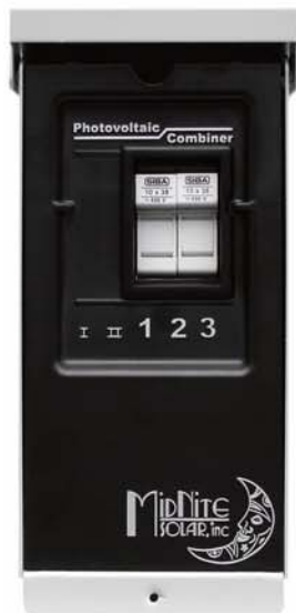
Configured for 600VDC fuses (Gridtie)

NOTE: All of the connections have a 90 deg C rating except the 2/0 positive lug that carries a 70 deg C rating. MidNite can supply 1/0 lugs to substitute in these cases where 90 deg C is required.