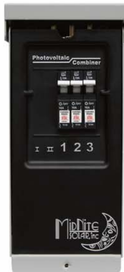
Configured for 150VDC breakers (Gridtie)