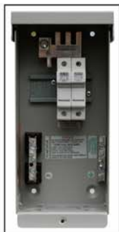
MNPV3 configured with two 600 VDC fuses

Breakers/fuse holders sold separately Boxed size: 11 x 5 x 4 weight: 2 Lbs.