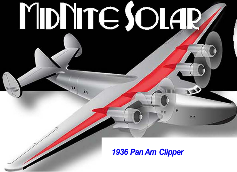
1936 Pan Am Clipper