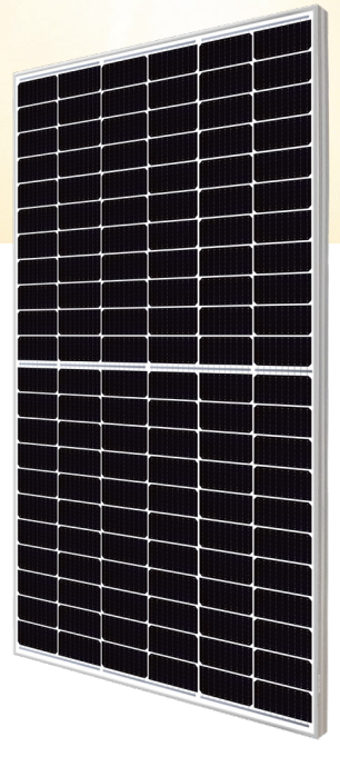
*Black frame product can be provided upon request.

Heavy snow load up to 5400 Pa, enhanced wind load up to 2400 Pa*